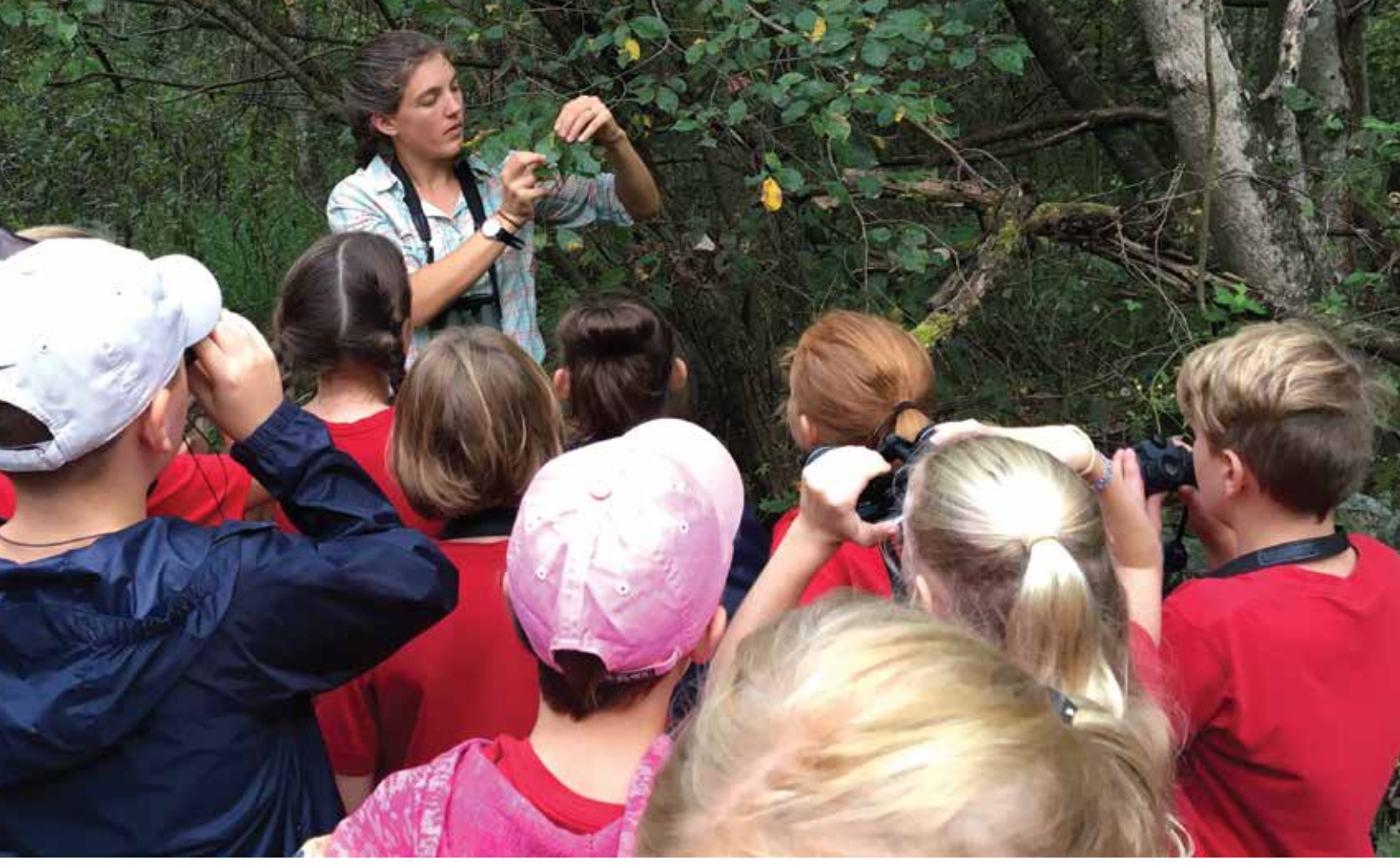
Clifton Institute - Meade Palmer Grant